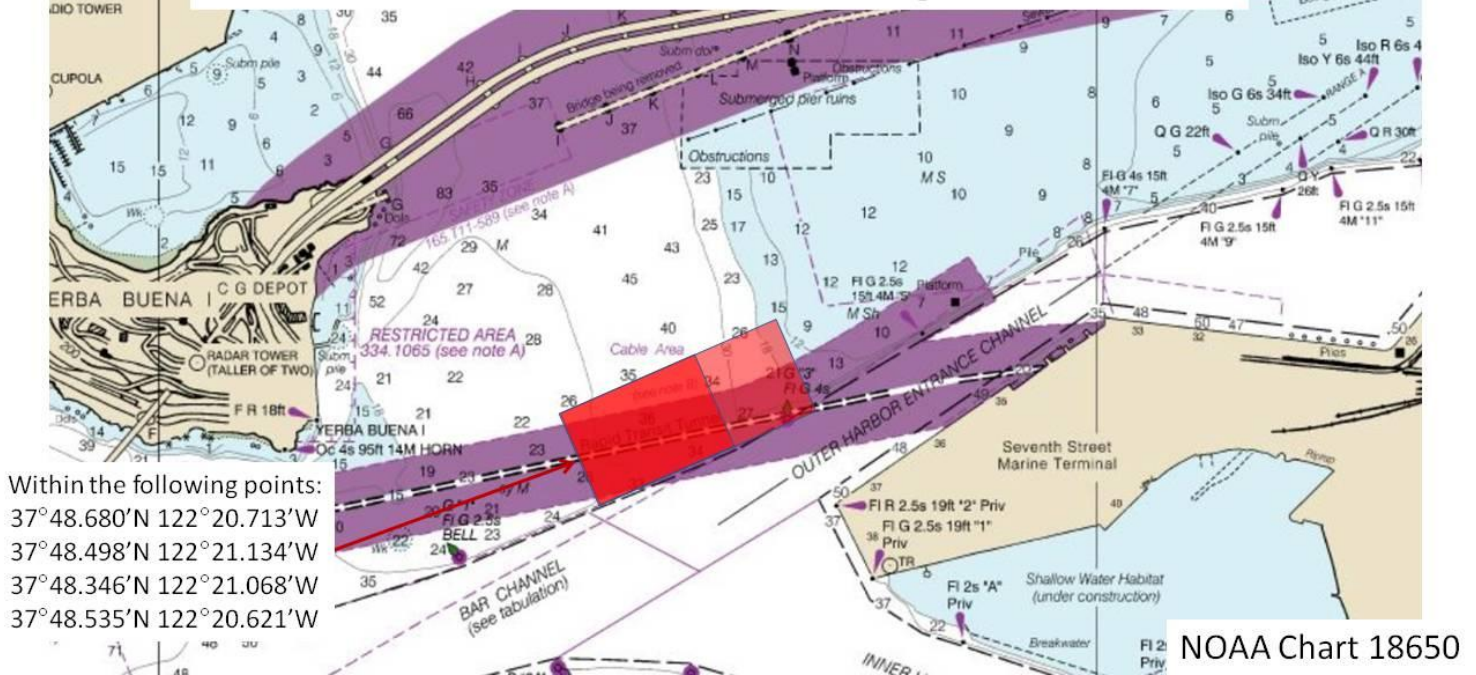
Chart is not for navigational purposes.

For more information on boating safety and required and recommended safety equipment, please visit www.uscgboating.org .